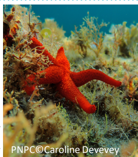
Red sea star