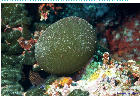
Green sponge ball