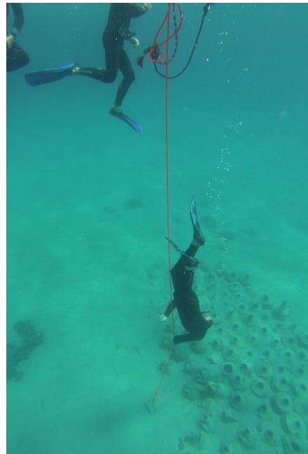
Pointe du Bouvet underwater trail Reconstituted Roman shipwreck