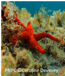
Red sea star Echinaster sepositus