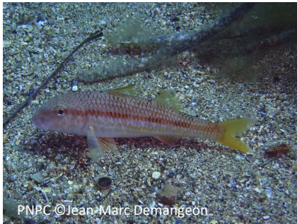
Striped red mullet Mullus surmuletus