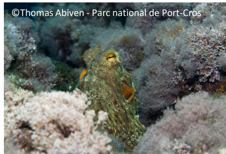
Octopus Octopus vulgaris