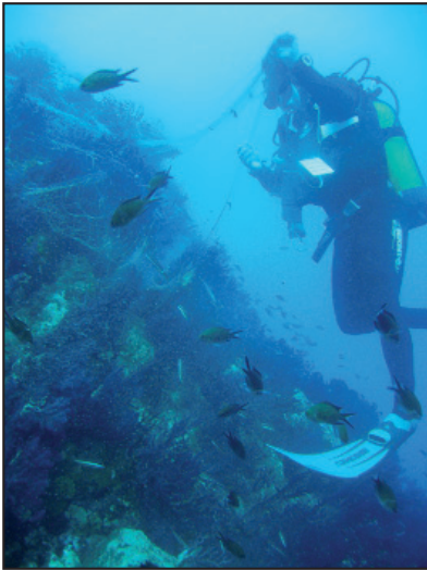
Figure 2. A lost fishing net (see Table I, locality 4; South-West of Montrémian, Bagaud, Port-Cros national Park), October, 2011.

the overall functioning of the ecosystem should be considered. Like discards and trawling (Andrew and Pepperell, 1992; Hall, 1999; Catchpole et al. , 2006; Kaiser and Hiddink, 2007), lost nets provide scavengers with an additional resource and therefore increase the role this functional compartment plays. They may also catch predators and/or scavengers attracted by entangled species, such as sea turtles, dolphins and fish (Cottalorda, 2011). Furthermore, lost nets, when entangled in fragile biota such as gorgonians, bryozoa, Cystoseira spp. and foliose corallines, can severely damage the benthic assemblage (Fig. 2).